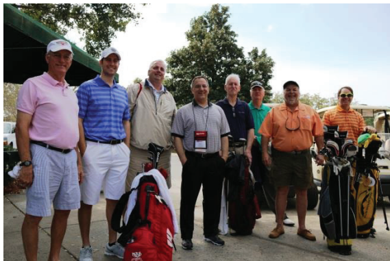
Golfers at a Trailways' Annual Golf Outing in 2015

The Dunes golf course is stunning and in-tune with its natural environment. It's located within a wildlife preserve sanctioned by the Audubon Society. It has been named the Best Golf Course in Lee County ( Gulf Shore Magazine 2015). Greens fees & cart, practice balls, box lunch, bus transportation and skill prizes are included in the fee. There will be a brief happy hour afterwards. Best Ball can be played using up to 4 people per team. Each player hits their own golf ball throughout the round; the low score (best ball) of the group serves as the team score. If you're a casual golfer, this format is fun and social! Please Register (see page 12) . The course address is 949 Sand Castle Road Sanibel Island, Florida 33957.