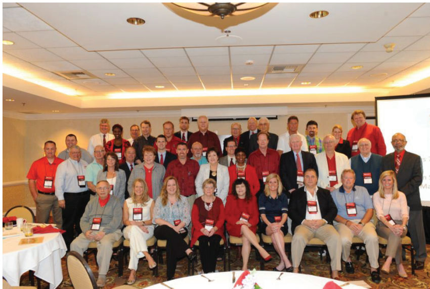
Trailways Stockholders gather for the Annual Roll Call at the 2015 meeting last year in San Destin, Florida.