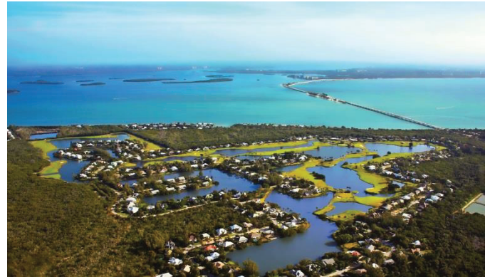
The Dunes Golf Course is on the Gulf of Mexico on beautiful Sanibel Island

The Dunes golf course is stunning and in-tune with its natural environment. It's located within a wildlife preserve sanctioned by the Audubon Society. It has been named the Best Golf Course in Lee County ( Gulf Shore Magazine 2015). Greens fees & cart, practice balls, box lunch, bus transportation and skill prizes are included in the fee. There will be a brief happy hour afterwards. Best Ball can be played using up to 4 people per team. Each player hits their own golf ball throughout the round; the low score (best ball) of the group serves as the team score. If you're a casual golfer, this format is fun and social! Please Register (see page 12) . The course address is 949 Sand Castle Road Sanibel Island, Florida 33957.